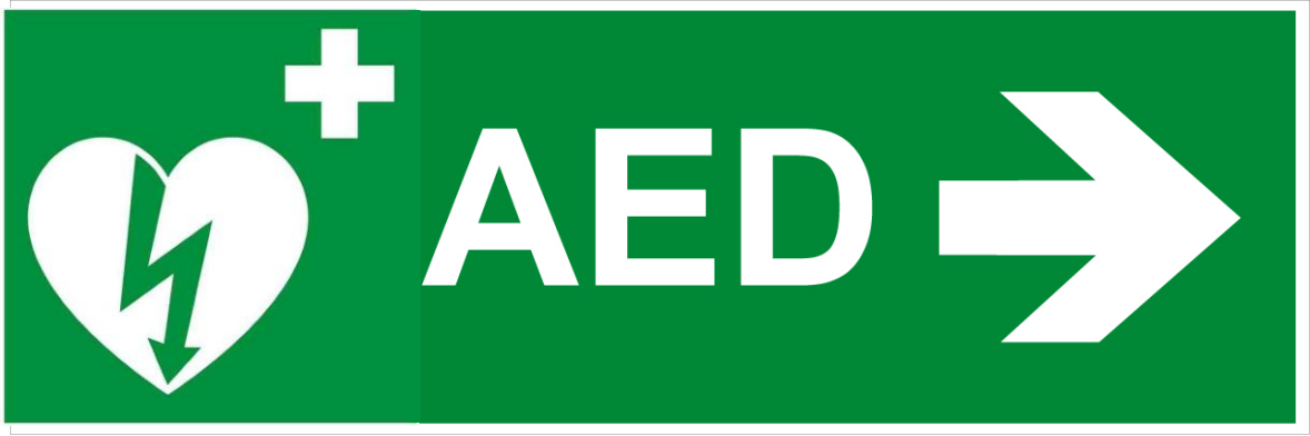
Possible combination with direction arrow

Size of the AED safety sign: there is, strictly speaking, no minimum or maximum size of a safety sign. The size is determined by the largest possible distance at which the sign must be readable and the light conditions: direct or indirect illumination, transparent signs with backlight, etc. The design principles for size and illumination are published by ISO 3864-1.